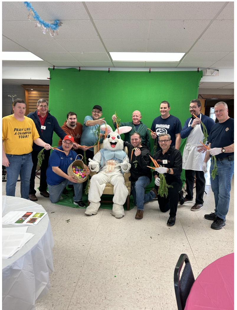
Breakfast with the Easter Bunny! Thank You