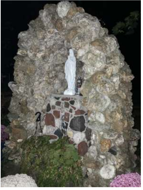
Outdoor Rosary at our Grotto. All are Welcome ... Please join us this month!!