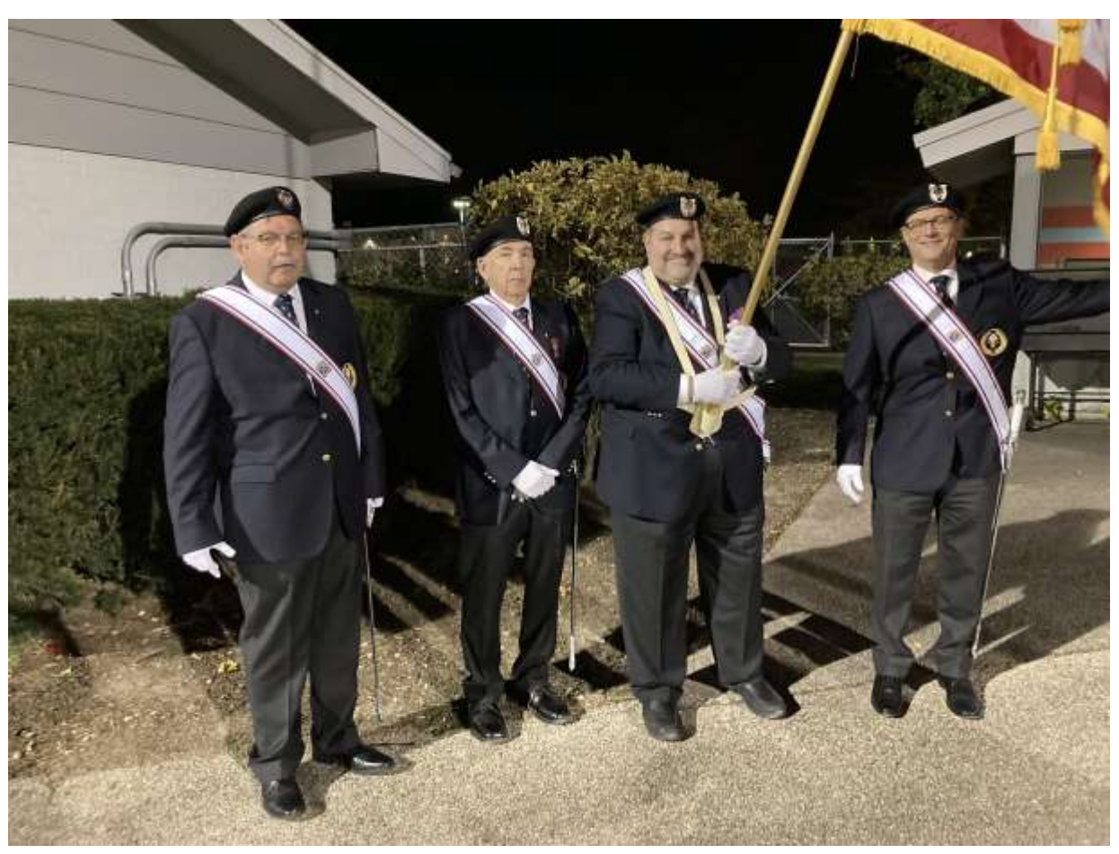
Color guard at Marion High School on Oct 21, 2022.