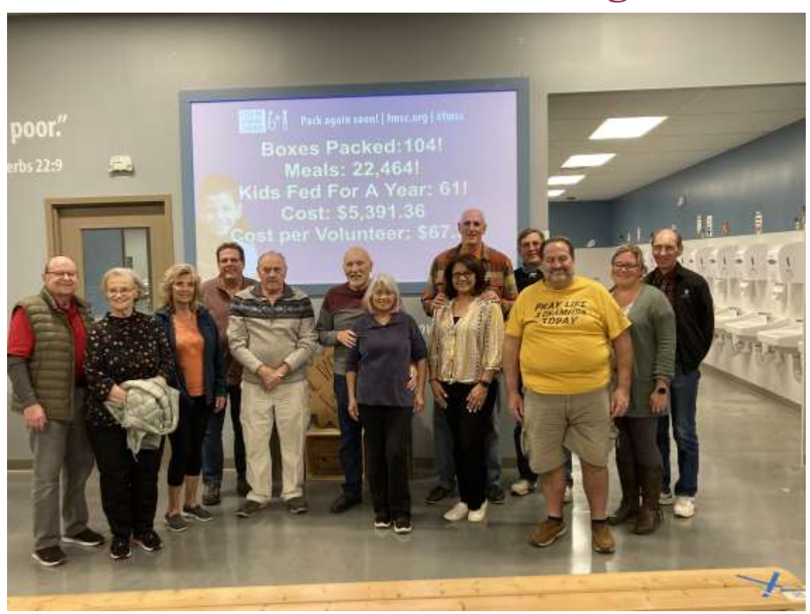
Feed My Starving Children on Oct 12, 2022 Come next time and bring the whole family!!!