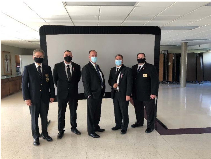
From the latest exemplification

Instructions for attending Virtually will be sent out in a separate email from the Grand Knight.