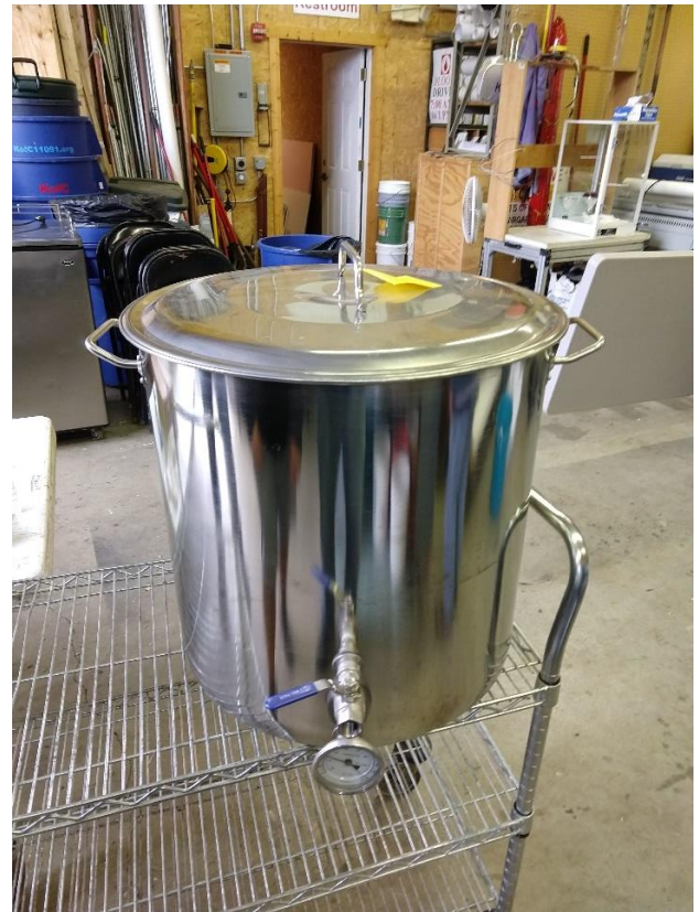
(2) Beer Pots