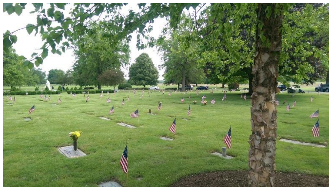
Honoring our fallen US Military on Memorial Day