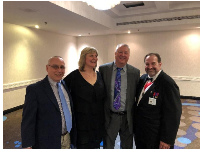
Attending the Illinois State Knights of Columbus Convention