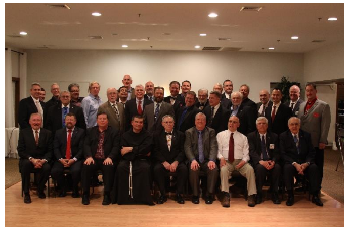
Knights in attendance