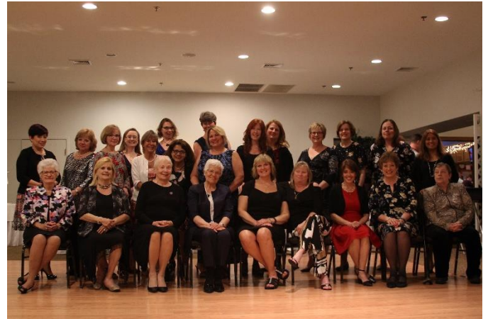
Our fair Ladies in attendance