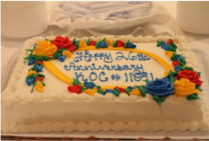
(Both the chocolate and vanilla were GREAT)

Congratulations to our Council on its 26 th Annual Anniversary. (Great tasting cake, by the way!)