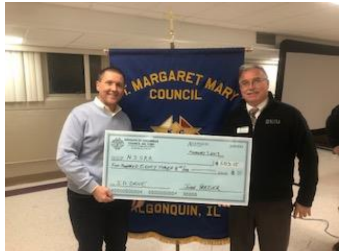
NISRA of Crystal Lake