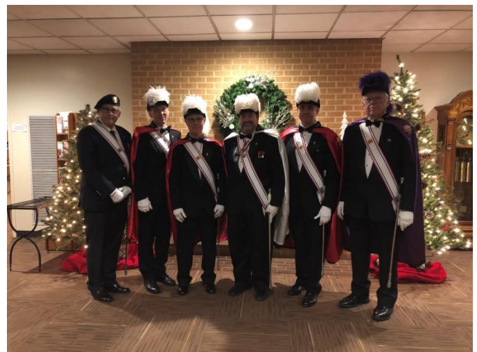
Our Honor Guard for Simbang Gabi at St. Margaret Mary Church