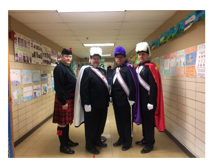
Ready for the Shamrock Shave!