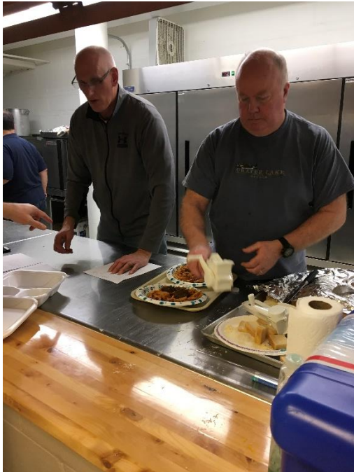
... his helpers plated it ...