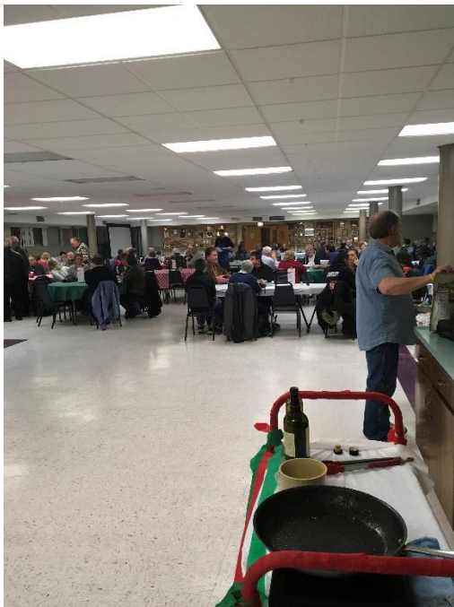
... and everyone loved it!