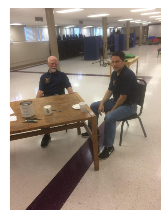
Thanks to all who contributed and helped!