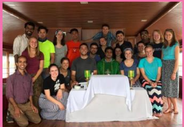
Mass on a houseboat along with members of Jesus Youth