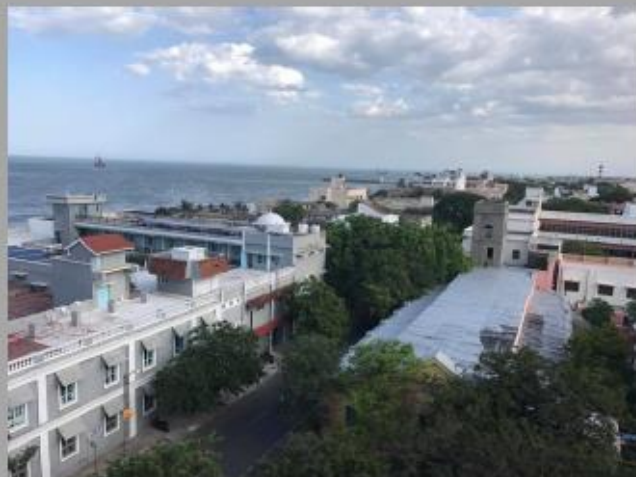
Overhead view of Pondicherry