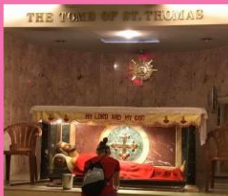
Praying at the tomb of St. Thomas the Apostle in Chennai, India