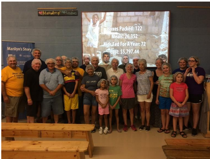
August Feed My Starving Children