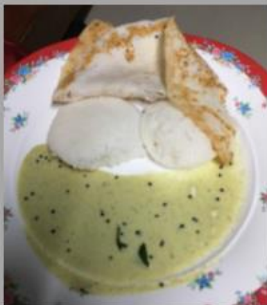
Typical Indian cuisine