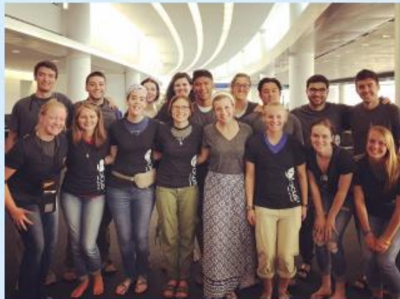
Our team in the airport before leaving for India