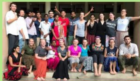
After a prayer meeting with members of Jesus Youth. This movement ministers to the youth of India in universities and in parishes. Members of the Jesus Youth movement were our guides throughout the trip.