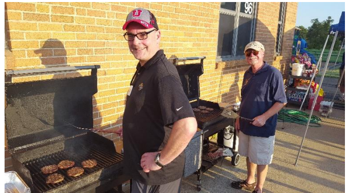
August School Nite-Out