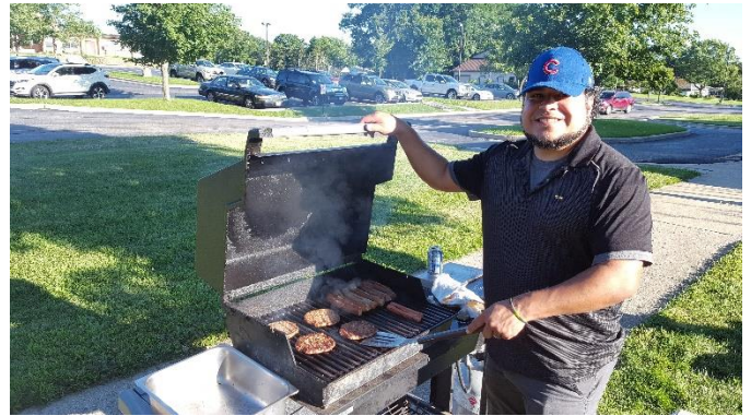
August Pop-up Picnic