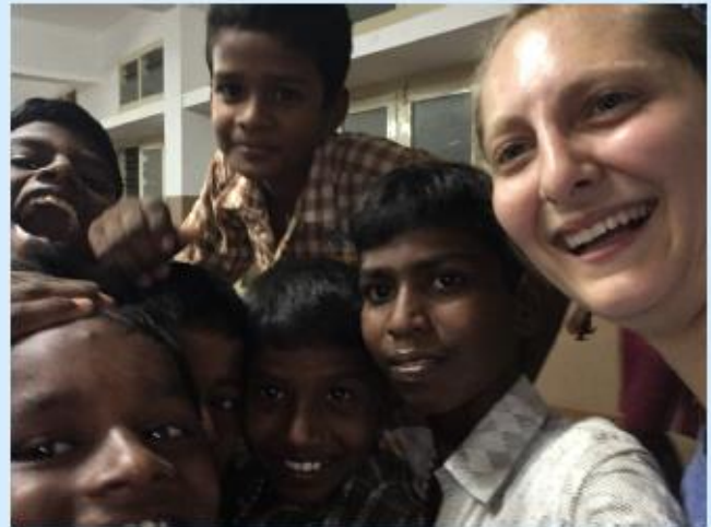
This is a photo taken at a St. John Bosco school for boys in Pondicherry. They loved taking selfies!