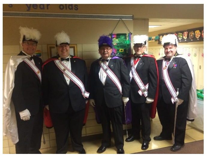
Shamrock Shave Color Guard