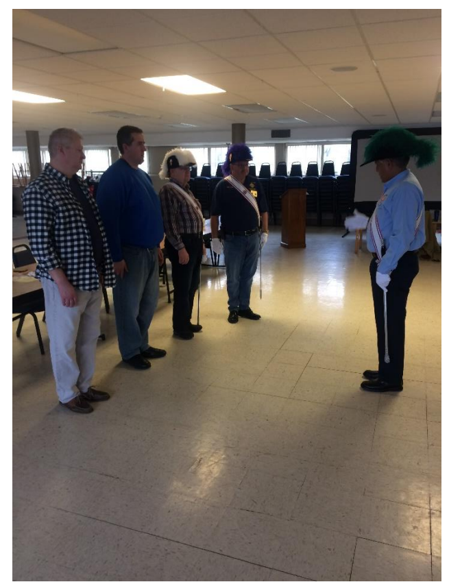
Color Guard training (no prior experience necessary ... and it is easy ... no test afterwards)