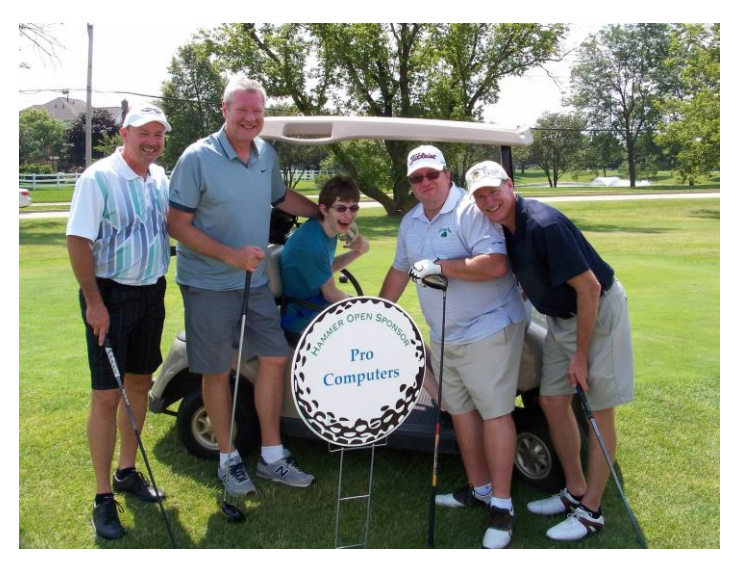
Some of us really needed practice ....