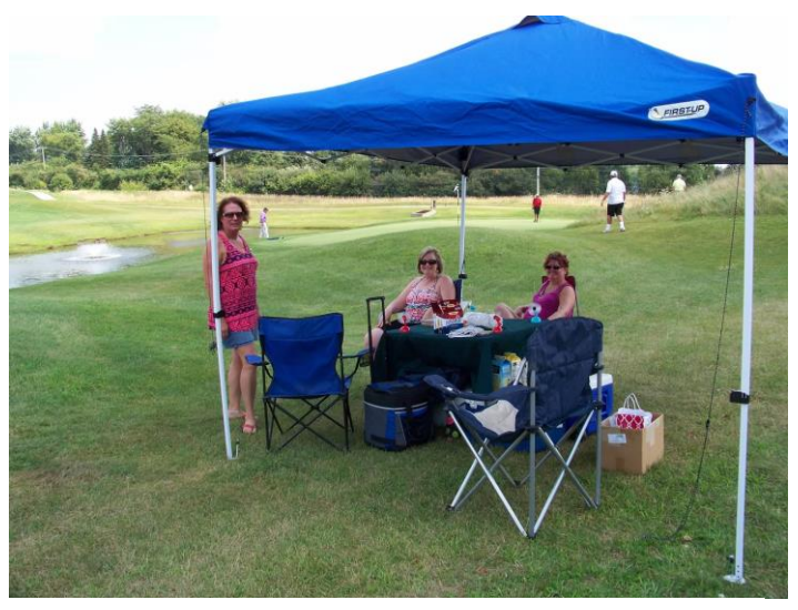
Some people look so good dressed like golfers, so, some of us came out just to look spiffy .....