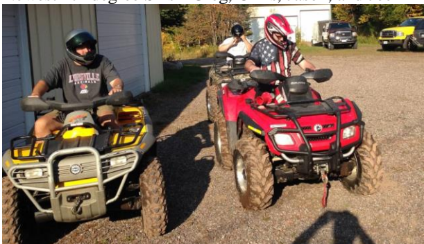
Great fun and weather at Men's Retreat last month