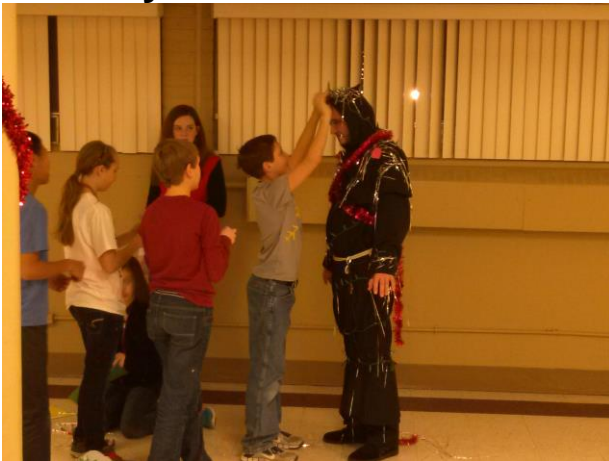
Worthy Chaplain at Altar Server Christmas Party - Dec 21