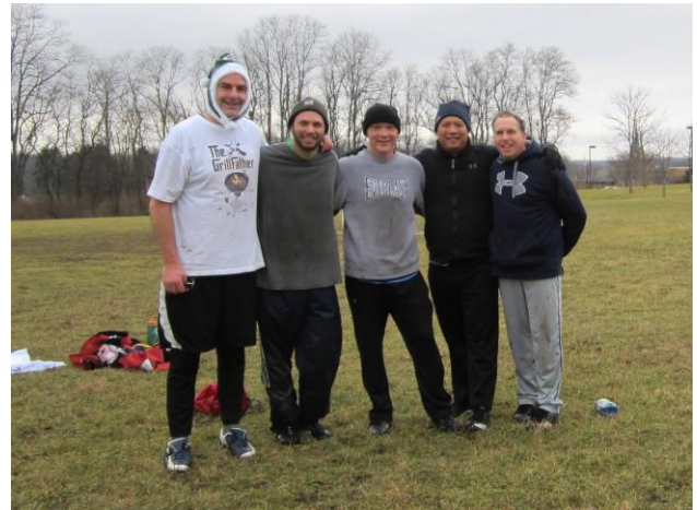
Latest round of Knights Flag Football