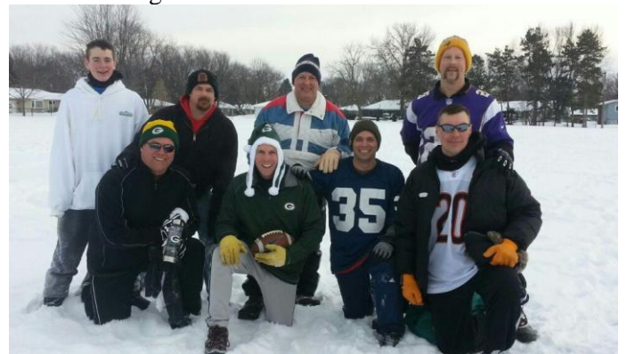
The Flag Football Super Bowl/Snow Bowl team