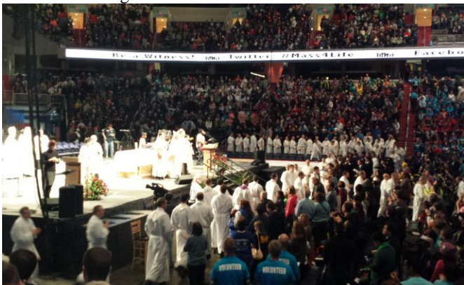
Rally and Mass at the Verizon Center