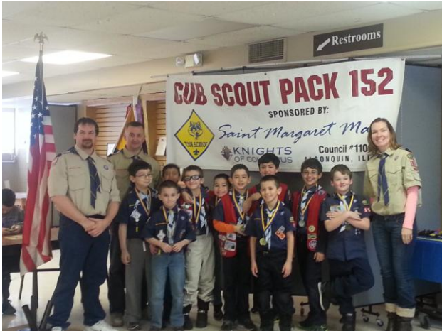
Cub Scouts at the Races for Pinewood Derby