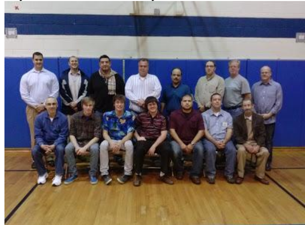
New 2nd and 3rd degree Knights from October