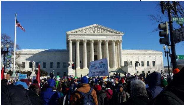
March for Life in Washington (Jan 21)