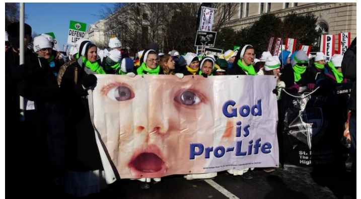
Sisters showing support at March for Life