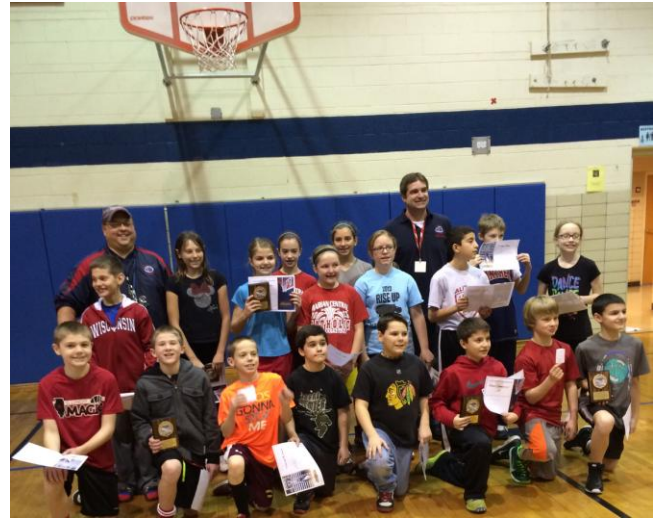
Good showing for KofC Freethrow Contest