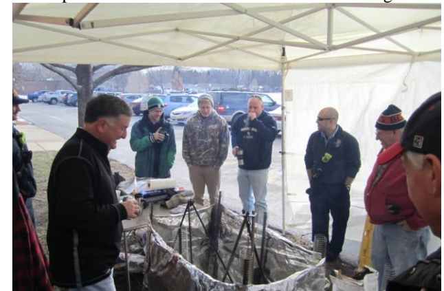
Knights prove to Fire Dept that we can grill even when it's freezing outside.