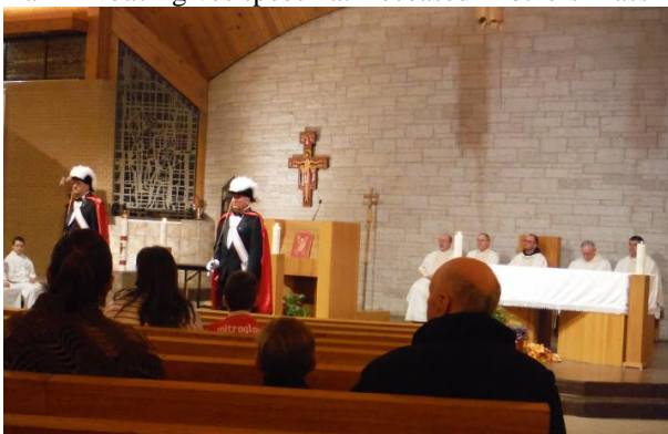
Opening of Deceased Brothers Mass