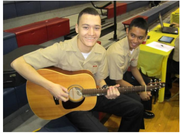
Happy tunes for Sailors at our SMM Thanksgiving Adopt-A-Sailor Event