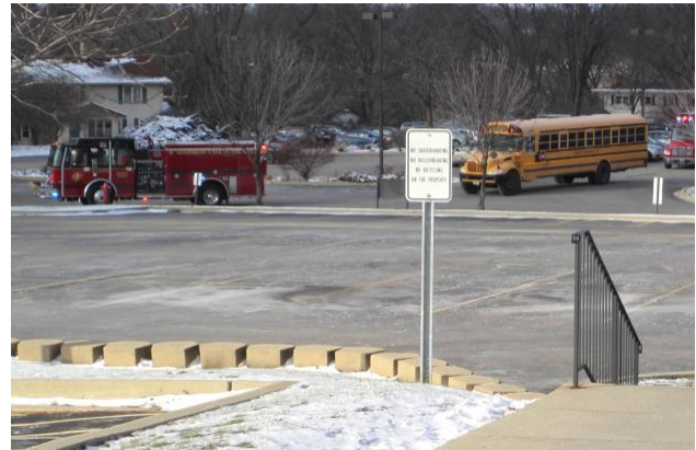
Fire Dept Escort to Welcome Our Sailors to St Margaret Mary