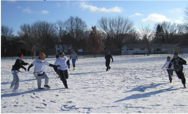
Thanksgiving Day - Knights Flag Football