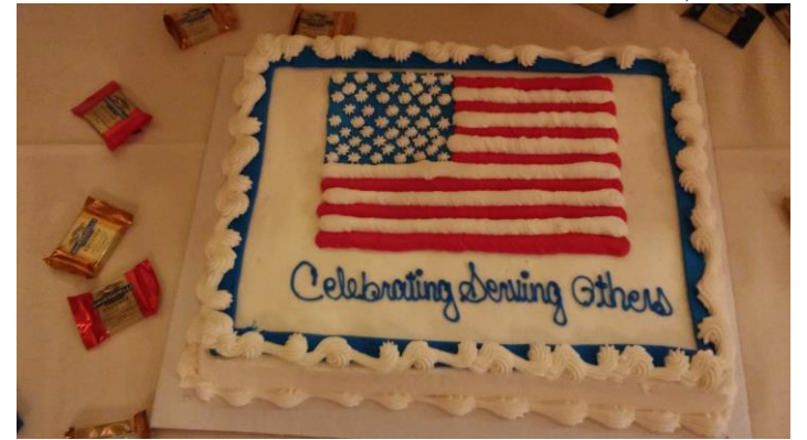
Great food and...

Our council is celebrated its 23<sup>rd</sup> year on Saturday, April 2 at the Golf Club of Illinois. Great event,