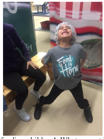
Children feeding children! What a great lesson for our children and grand-children to learn! (There were more kids there than adults!)