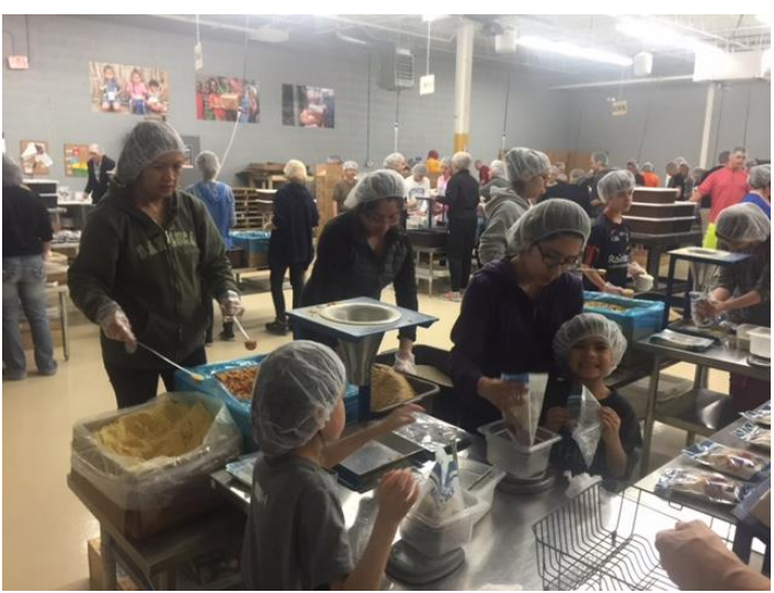
WATCH FOR OUR NEXT ANNOUNCEMENT and please come and join us! There really is FUN involved in helping others!