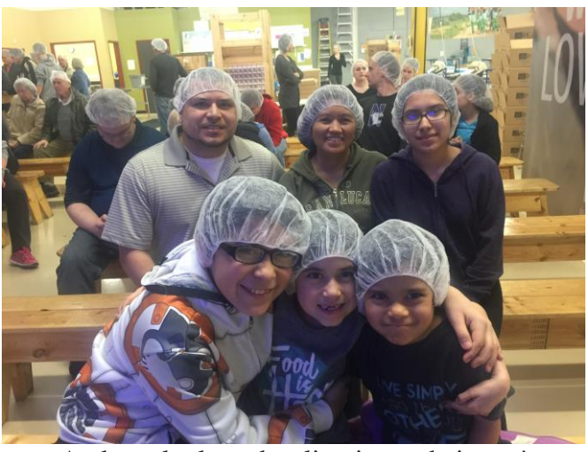
And, we look so dazzling in our hairnets!