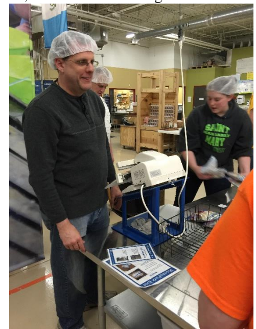
Well ... there are exceptions, of course!