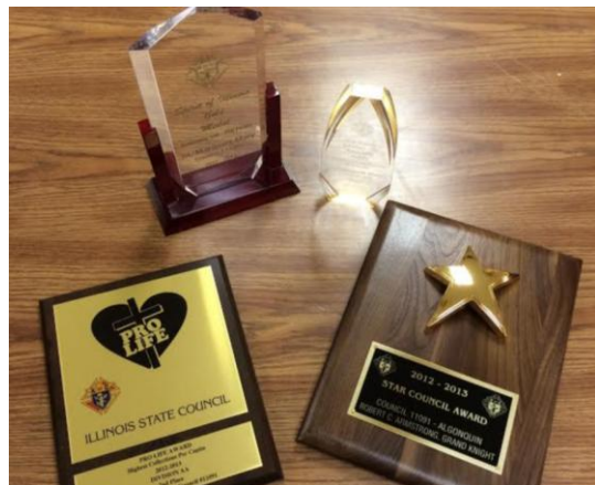
Council Awards received at March's Council Meeting