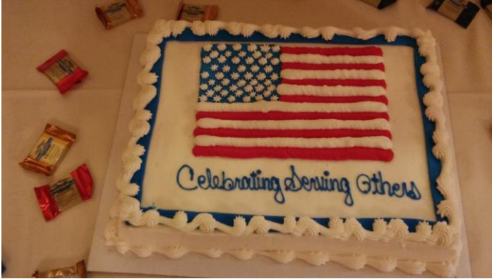
Great food and...

Our council is celebrated its 23 rd year on Saturday, April 2 at the Golf Club of Illinois. Great event,