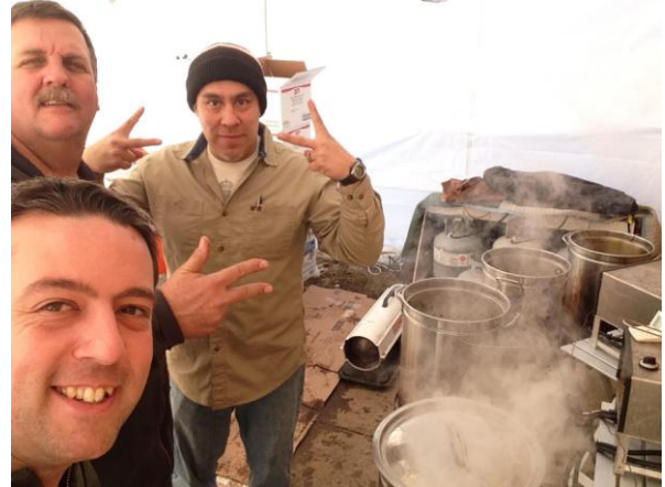
The Fry Crew at our KofC Fish Fry's