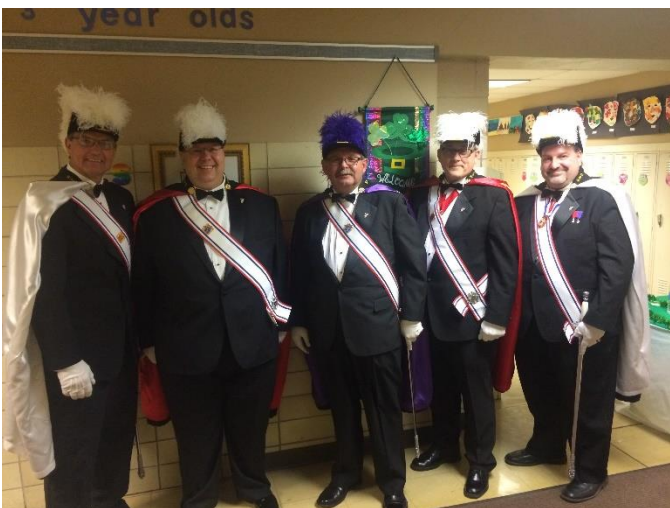
Shamrock Shave Color Guard