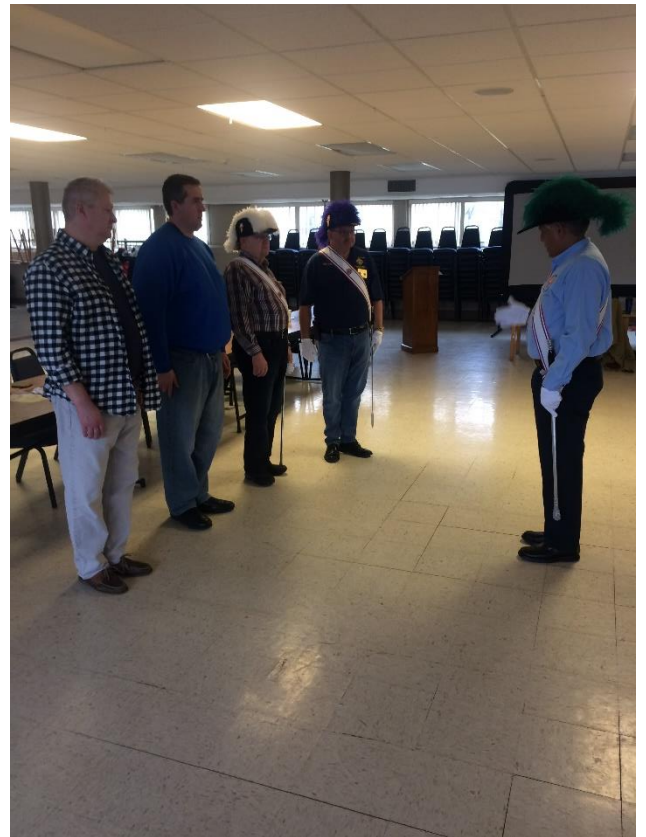
Color Guard training (no prior experience necessary ... and it is easy ... no test afterwards)