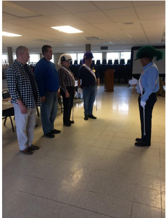
Color Guard training (no prior experience necessary ... and it is easy ... no test afterwards)